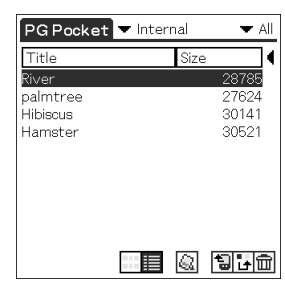
By name and date (List mode)

You can change the image file list screen to display items by name and date, or by thumbnail image.