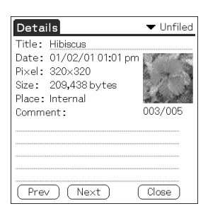
Show detailed information

Tap [4] (detailed) while the image file is displayed. Detailed information for the image file appears.