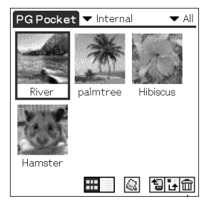
By thumbnail image (Preview mode)

To display the image file list by name and date (List mode)